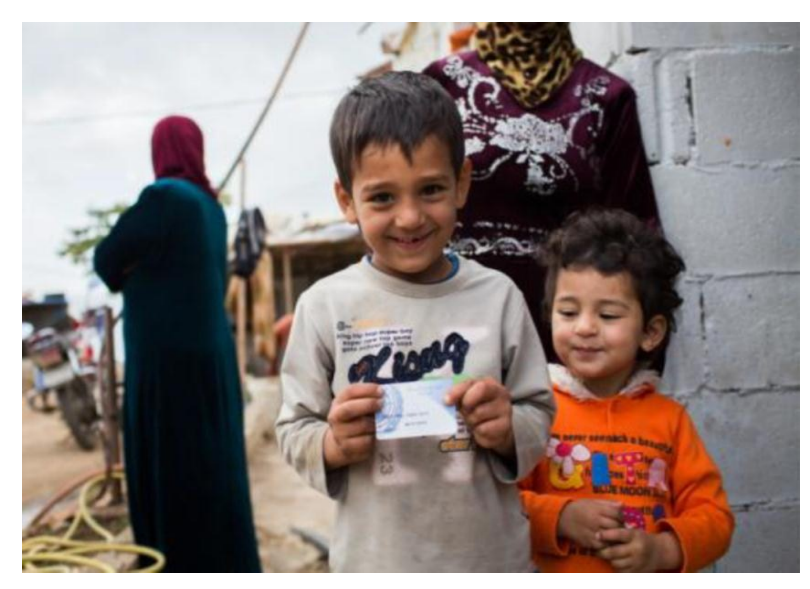
Syrian refugee children holding a new ATM card.