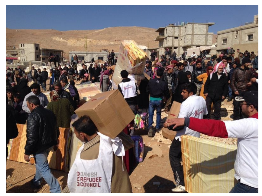
New arrivals are pre-registered and provided with assistance by humanitarian partners in Arsal.

The regional response for refugees fleeing Syria is the coordinated effort of 155 participating organizations, including 105 appealing agencies: